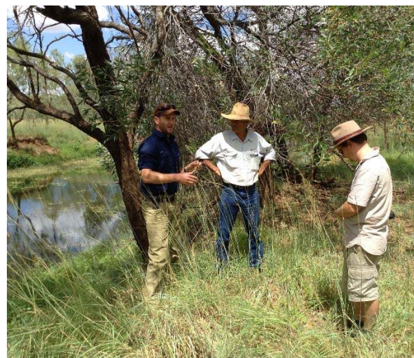
Figure 6. Cattle management planning in The Kimberley.