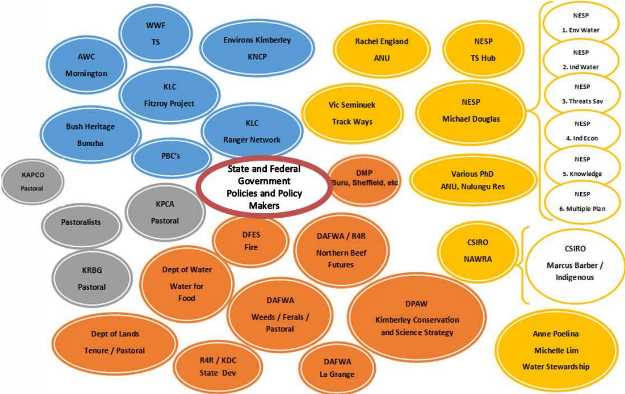
Fig. 2. Snapshot of NRM Stakeholders in the Fitzroy Catchment 2016. (Blue – Non-Govt. Organisation, Grey – Pastoral, Orange – Govt, Yellow – Research).

The Fitzroy Catchment provided a very different challenge. Not only do we have a mass of externally driven activity (Fig. 2), the local groups have very different world views and values and there is disconnection and mistrust locally and a disconnection from the decision-making focus in Perth (Hill et al. 2005; Preston 2017).