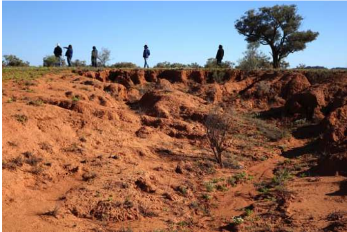
Figure 3 Doing practical activities: Ltyentye Apurte rangers and scientists inspect an erosion gully before starting erosion control works on the Land Trust.