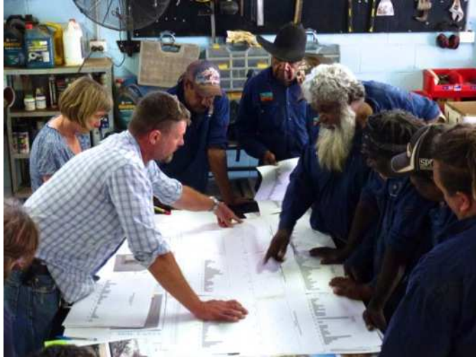
Figure 1. Records of change: Ltyentye Apurte rangers and scientists on the project team discuss graphs of historical weather data from central Australia.

Scientists on the project team used graphs of temperatures and rainfall from three locations in central Australia to explore changes over time visually. For example, Alice Springs records show a steady increase in the number of days over 40°C since the 1970s; average temperatures have risen by 1.0 °C in summer and by 1.5 °C in winter; and rainfall has become more variable. Scientists discussed causes of climate change with the rangers.